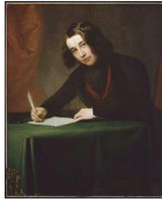
Charles Dickens (1842)