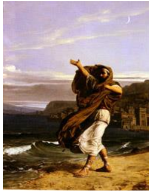
Demosthenes Practising Oratory (1870)

This Project is something with which you should be able to have fun .